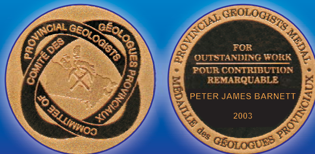
Obverse and reverse images of the 2003 Provincial Geologists Medal.

Ontario. The regional stratigraphy and concepts related to tunnel valley formation that he established, as a result of 1:50,000 and 1:20,000 scale mapping, were revolutionary. Work with researchers from the Geological Survey of Canada during the 1990s resulted in a new understanding of the construction of the Oak Ridges Moraine that has profound implications on groundwater management and the volume and location of industrial mineral resources.